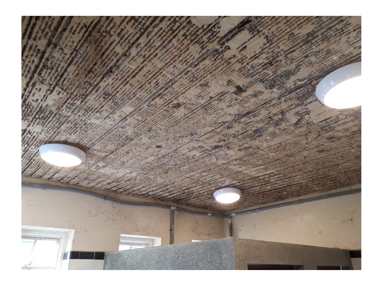
Appendix 1 - Stripped toilet block ceiling (June 2018)